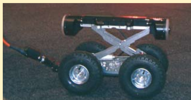
Panoramio Camera Technology

The potential for the utilisation of this innovative technology to gain new contracts, as well as add a highly specialised and sought after technology to our already vast portfolio, will put Veolia ahead of its competitors. ■