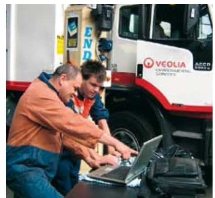
On the job training

It's important to retain an edge over competitors; hence our investment in staff training as it improves staff performance, making our business more productive – and therefore more competitive. ■