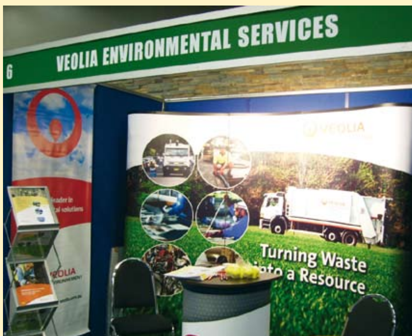
Veolia's Booth at the NSW Waste Conference