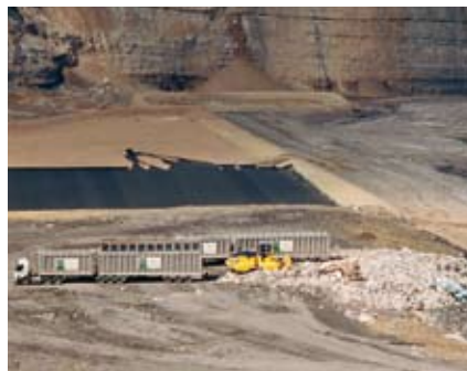
TiTree BioEnergy Facility

Based on current waste intake, it is estimated that by October 2007 production capacity will have increased