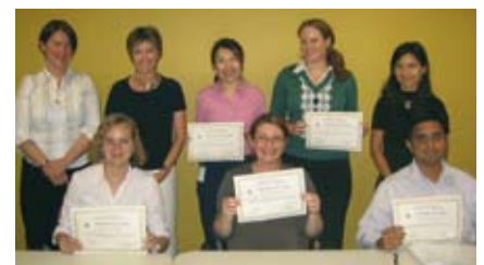
Proud participants of the Beginners French Course

A small group of Veolia Employees recently completed their beginners level French Lessons. Learning everything from daily greetings to more difficult conversations, the groups thoroughly enjoyed the course and would recommend it to anyone! ■