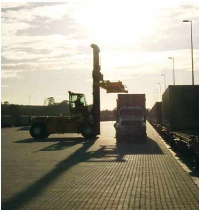
Woodlawn Facility in Action

■ The Woodlawn Waste Management facility has now been operational for two years, having taken over 600,000 tonnes of waste from Sydney within that time. As such, plans are now underway to produce green energy from the methane produced by this waste.