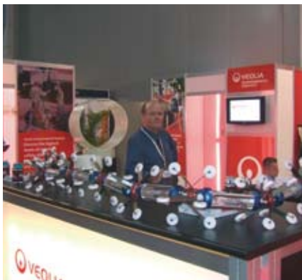
No Dig Conference 2006

■ Veolia Environmental Services – Pipeline Services certainly made a presence at the recent No Dig 2006 Conference, held at the Brisbane Exhibition and Convention Centre in October.