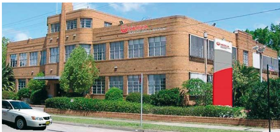
Projected Rosehill Depot