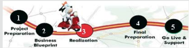
VESPA Project Plan

a selection of our business users and managers, from all states and divisions.