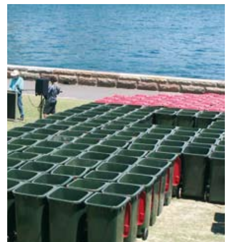
339 Bins were used to represent the weekly carbon emissions from a household

We welcome all Veolia employees to take the True Green challenge and visit our website at www.betruegreen.com . Copies of True Green are available online and at ABC shops and part of all proceeds from the sale of True Green benefit Clean Up Australia. ■