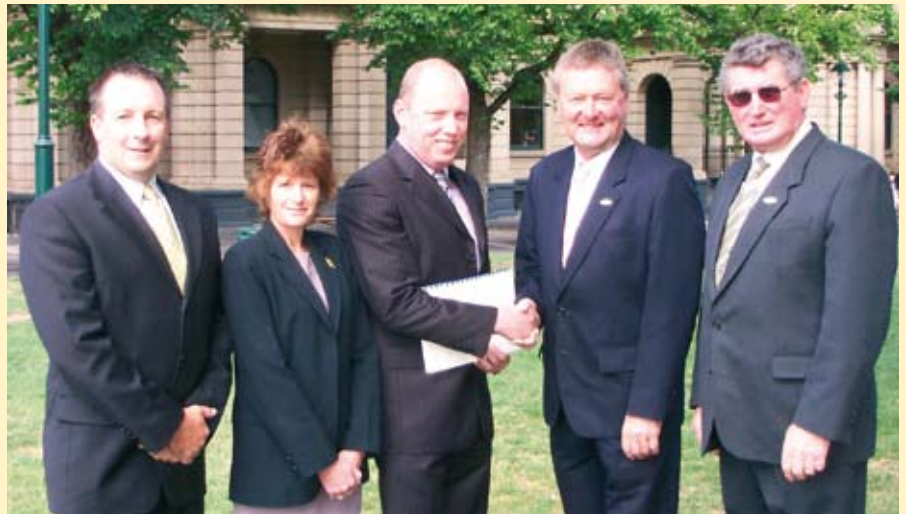
Vict Keep Australia Beautiful Plastic Bag Reduction Awards 2006

Incorporating public advocacy, community education, school, retail