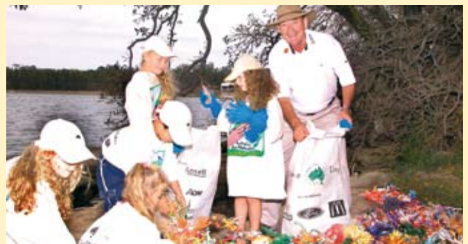
Clean Up Australia Day 2006

For information on registering your own site visit www.cleanup.org.au , or contact renee.fry@veoliaes.com.au to register your interest in participating in a VES run site. ■