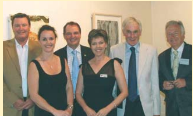
Ipswich Charity Cocktail event – Stroke of Art 2006

The exhibition will be held again next year in May 2007 with the theme “These Boots are Made for Walking”. ■