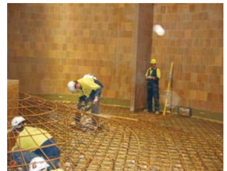
Installation of reinforcement steel bars in progress for concreting of tank floor

Veolia Refractory is proud of completing this job without any Lost Time Injury (LTI), which, when considering the sheer size and requirements of the project, is a superb achievement. The successful completion of the project on time, in budget, and without any major incident is a credit to the entire team. ■