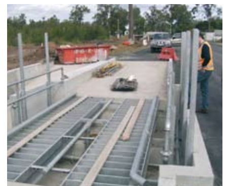
Construction of the New Cell