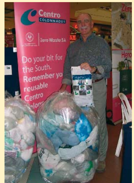
Centro Colonnades plastic bag reduction in action

For further information on the awards, visit www.kab.org.au/plasticbags ■