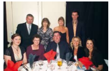
The victors with their award

Much to our delight Veolia was named the winner of the Trade/Services Business category sponsored by Matthews Constructions. This was a compliment to all the VES staff operating in the North West region of the state. ■