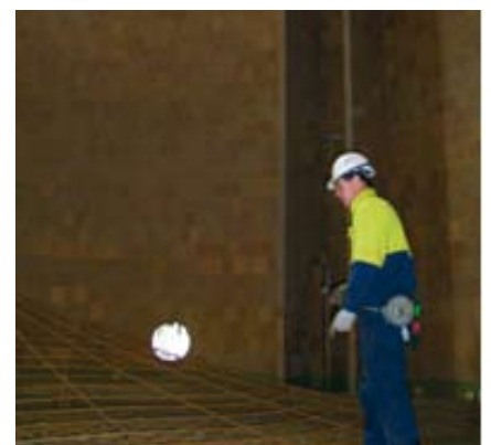
Inspection of tank floor after installation of reinforcement steel bars for concreting