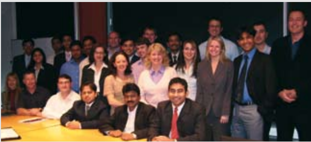
The SAP/ VESPA Team

We have now achieved the first two phases of Project Preparation and Blueprinting, which means that the design of the new solution has been completed and reviewed by