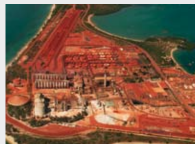
Aerial View of Alcan Alumina Refinery at Gove, NT

At present Veolia ES has a crew of 35, working a 28 day cycle, carrying out the main work on site; abrasive blasting and painting, hydro-blasting and vacuum loading. We have also performed many other tasks including, but not limited to, house keeping, removal of graffiti and cold cutting. ■